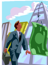
Donations helped avoid taking out costly financing.

As of today, this year’s contributions totaled over $3,000, with