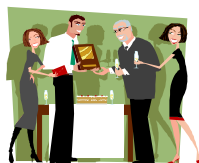
Reminisce the Good 'ol days with other YITBOS

Although not booked yet Carnation Ball is expected to be held on Saturday night and a host of events for alumni and actives will be scheduled in-